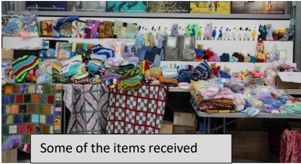
Some of the items received