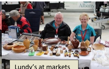
Lundy's at markets