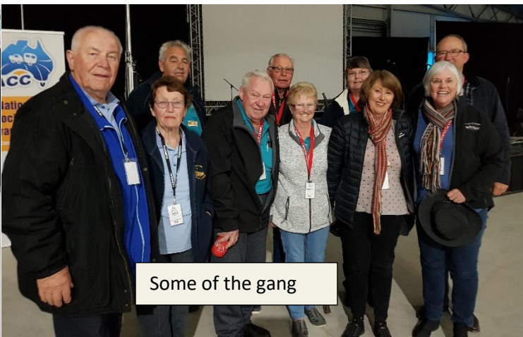
Some of the gang