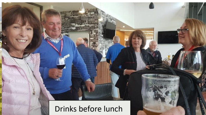
Drinks before lunch