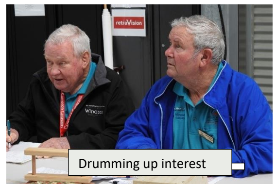
Drumming up interest

There is just so much more I could add, you will no doubt hear more stories at our Christmas Rally. Apologies if I have missed anyone, spending half the time off site made it hard to keep up with what people were doing.